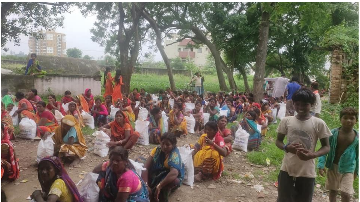
Covid 19 relief distribution in Bikram block and Bihata Block of Patna district