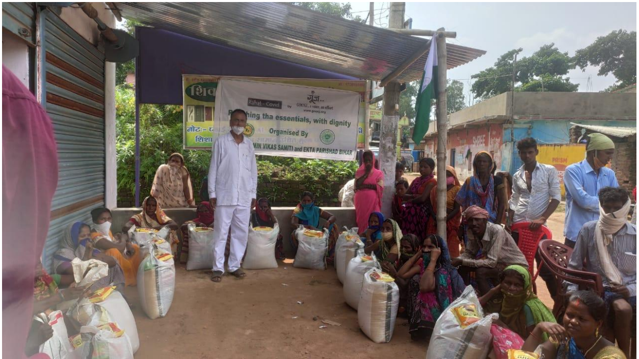
Covid 19 support by goonj in Naubatpur Block Patna and Mujaffarpur district